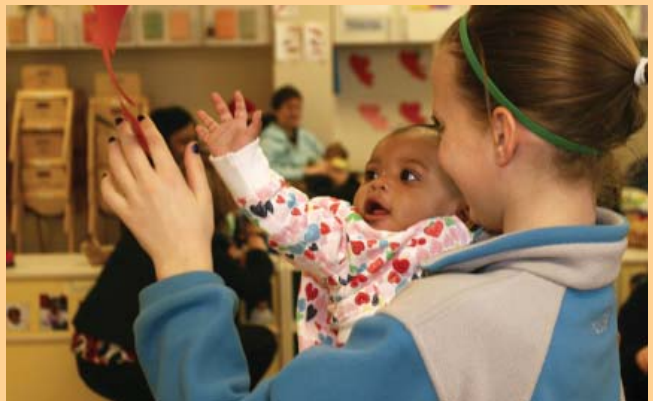
A volunteer with one of the VISIONS babies.